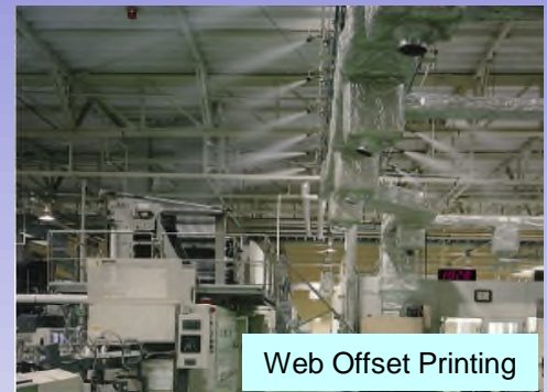
Web Offset Printing