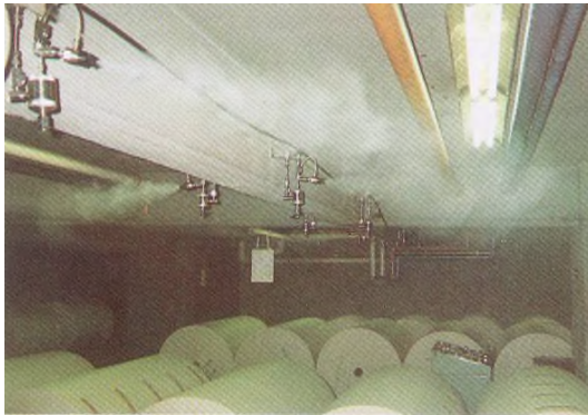
The Mainichi Newspapers